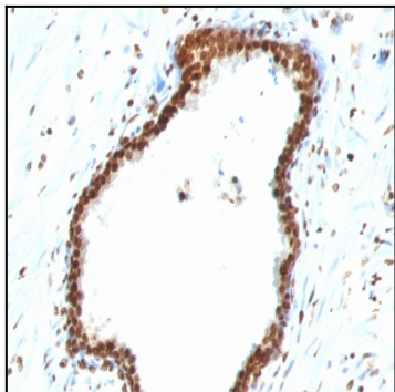
Formalin-fixed, paraffin-embedded human Colon Carcinoma stained with Double Stranded DNA Monoclonal Antibody (121-3)