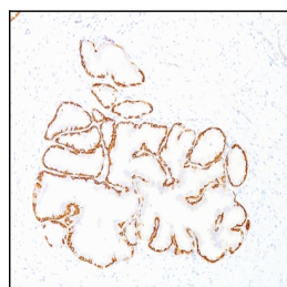
Formalin-fixed, paraffin-embedded human Prostate Carcinoma stained with Cytokeratin 14 Monoclonal Antibody (SPM263).

Immunofluorescence (1-2ug/ml); Immunohistochemistry (Formalin-fixed) (1-2ug/ml for 30 minutes at RT)(Staining of formalin-fixed tissues requires heating tissue sections in 10mM Tris with 1mM EDTA, pH 9.0, for 45 min at 95&degC followed by cooling at RT for 20 minutes);