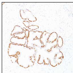
Formalin-fixed, paraffin-embedded human Prostate Carcinoma stained with Cytokeratin 14 Monoclonal Antibody (SPM263).

Immunofluorescence (1-2ug/ml); Immunohistochemistry (Formalin-fixed) (1-2ug/ml for 30 minutes at RT)(Staining of formalin-fixed tissues requires heating tissue sections in 10mM Tris with 1mM EDTA, pH 9.0, for 45 min at 95°C followed by cooling at RT for 20 minutes);