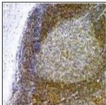
Fig:3 Immunohistochemical analysis of Livin in formalin-fixed, paraffin embedded human tonsil (secondary nodule) using 20-1069 at 1:2000. Hematoxylin-eosin counterstain.