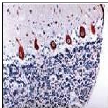
Fig:3 Formalin-fixed paraffin-embedded tissue section of dog cerebellum stained for Active/Cleaved Caspase-6 expression using Caspase-6 (20-1041) antibody at 1:2000. Hematoxylin-eosin counterstain.